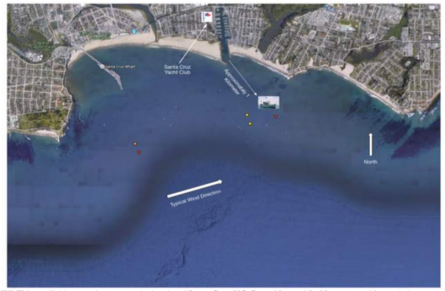
Wi-Fi is available near the regatta shed; select "Santa Cruz YC Guest Network". No password is needed.

The SCYC restrooms and showers on the lower deck below the clubhouse are always open. The combination is 9000*.