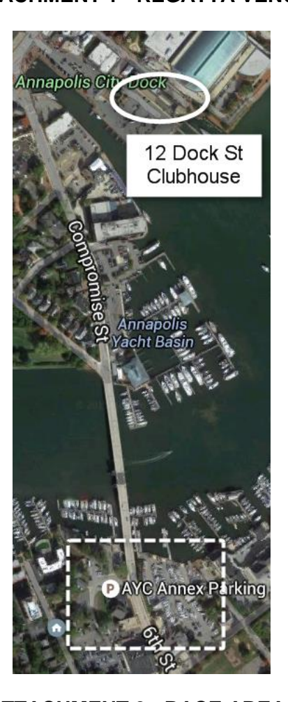
ATTACHMENT 2 - RACE AREA