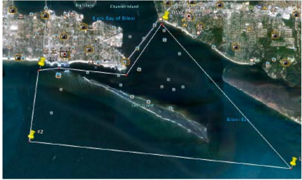
Sunday Race 3

Race 1: Start-GM#12 (Leave to port)-GM#2 (Leave to Port)-Ship Island Finish Race 2: Start-GM#2 (leave to starboard)-GM#12 (Leave to starboard)-OSYC Finish