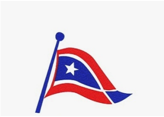
Corpus Christi Yacht Club