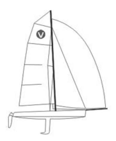
One Design March 18 -19

Viper 640, Vanguard 15, VX One, Flying Scot (Open), Etchells, MC Scow, Finn, J/30, J/22, Rhodes 19, Melges 24, Melges 32, Hobie 33, etc.