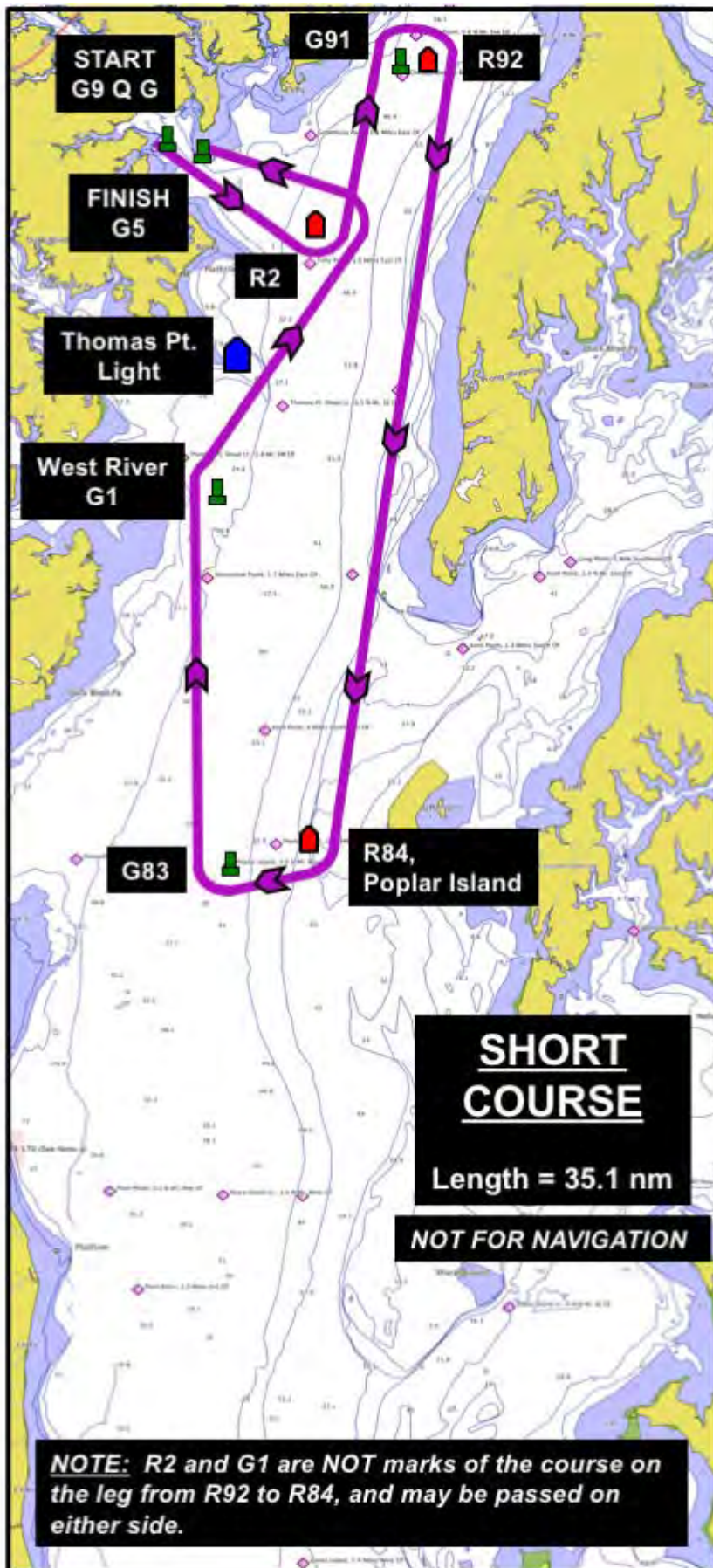
FIGURE 3. Boomerang Race – SHORT COURSE