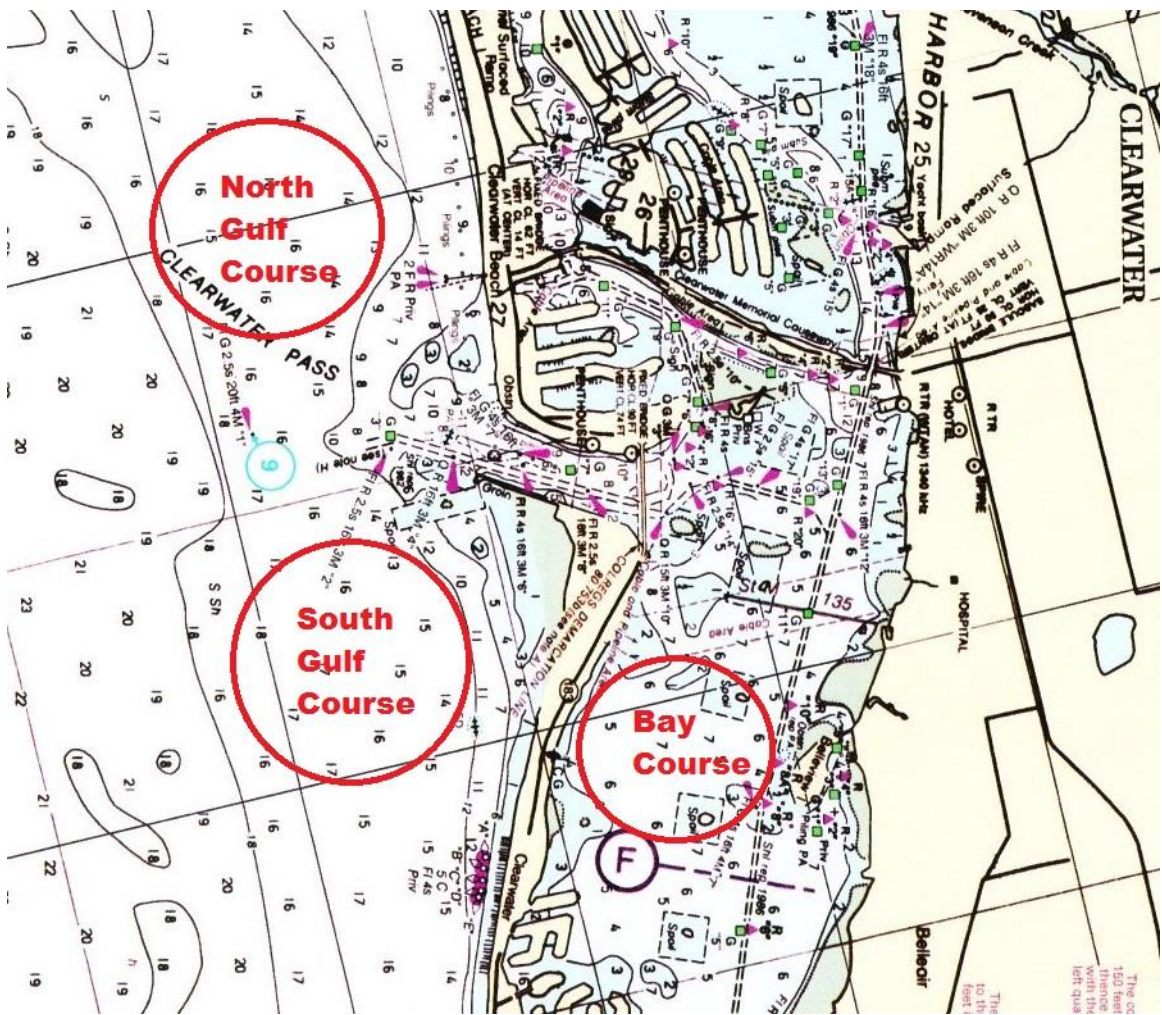
Diagram A: Possible Racing Areas