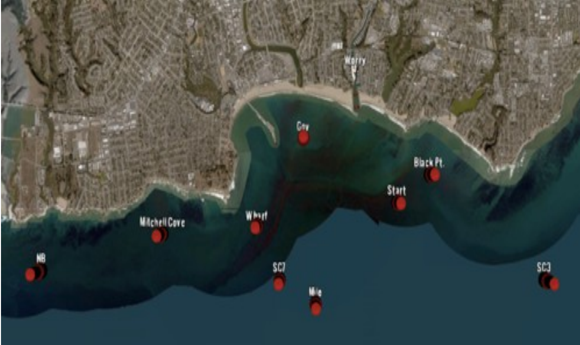
Chartlet indicating relative positions of marks (not to be used for navigation)