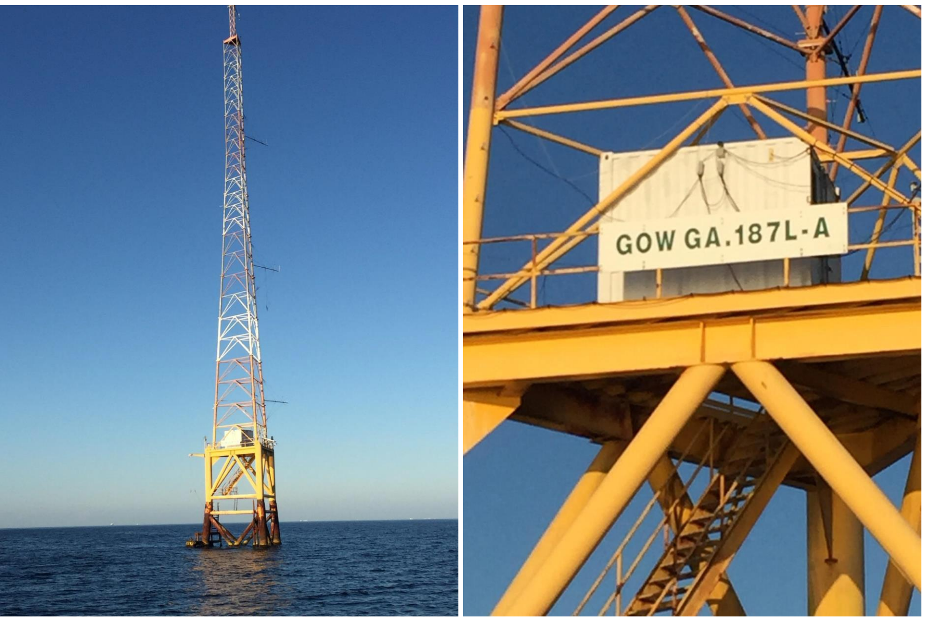
"GA 187L-A" Approximate Position: N 29<sup>o</sup> 08.52' W 094<sup>o</sup> 47.83'