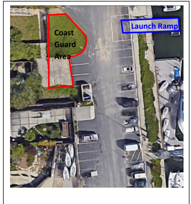
Santa Cruz Small Craft Harbor – MAP 3