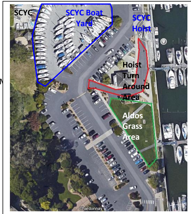
Santa Cruz Small Craft Harbor – MAP 2