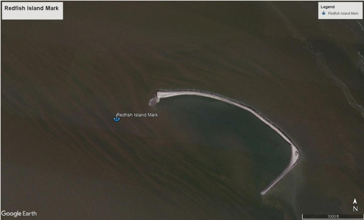
E Mark (Range Marker):