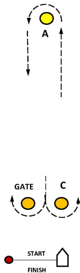
COURSE 5 and 6 DIAGRAM and ROUNDING ORDER (Not to Scale)

COURSE 2: START - A - C (or GATE) - A - C (or GATE) - A - FINISH