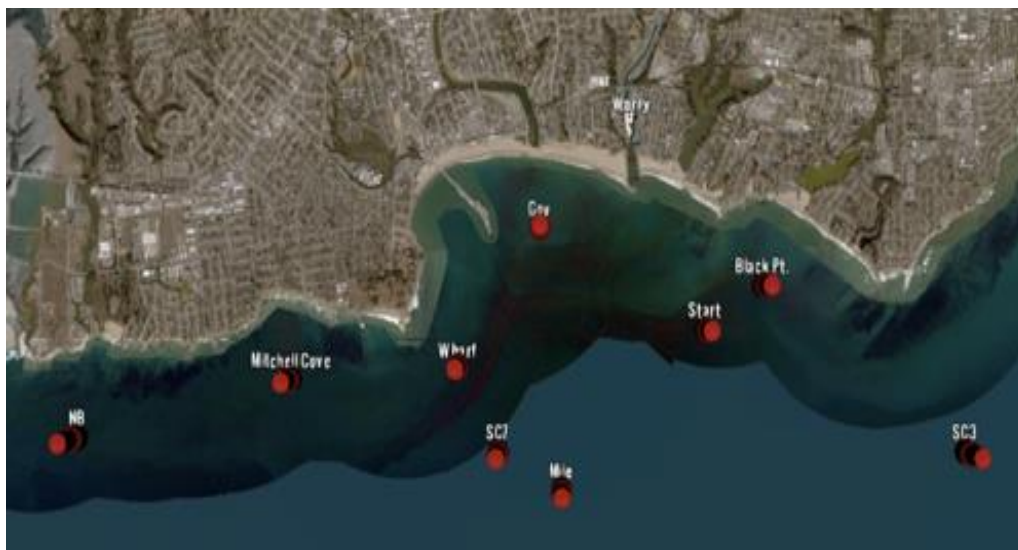
Chart indicating relative positions of marks (not to be used for navigation)