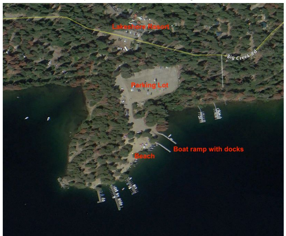
Closeup of Beach/Boat Ramp/Parking Lot Area

Road to Lakeshore, California (aka Huntington Lake)