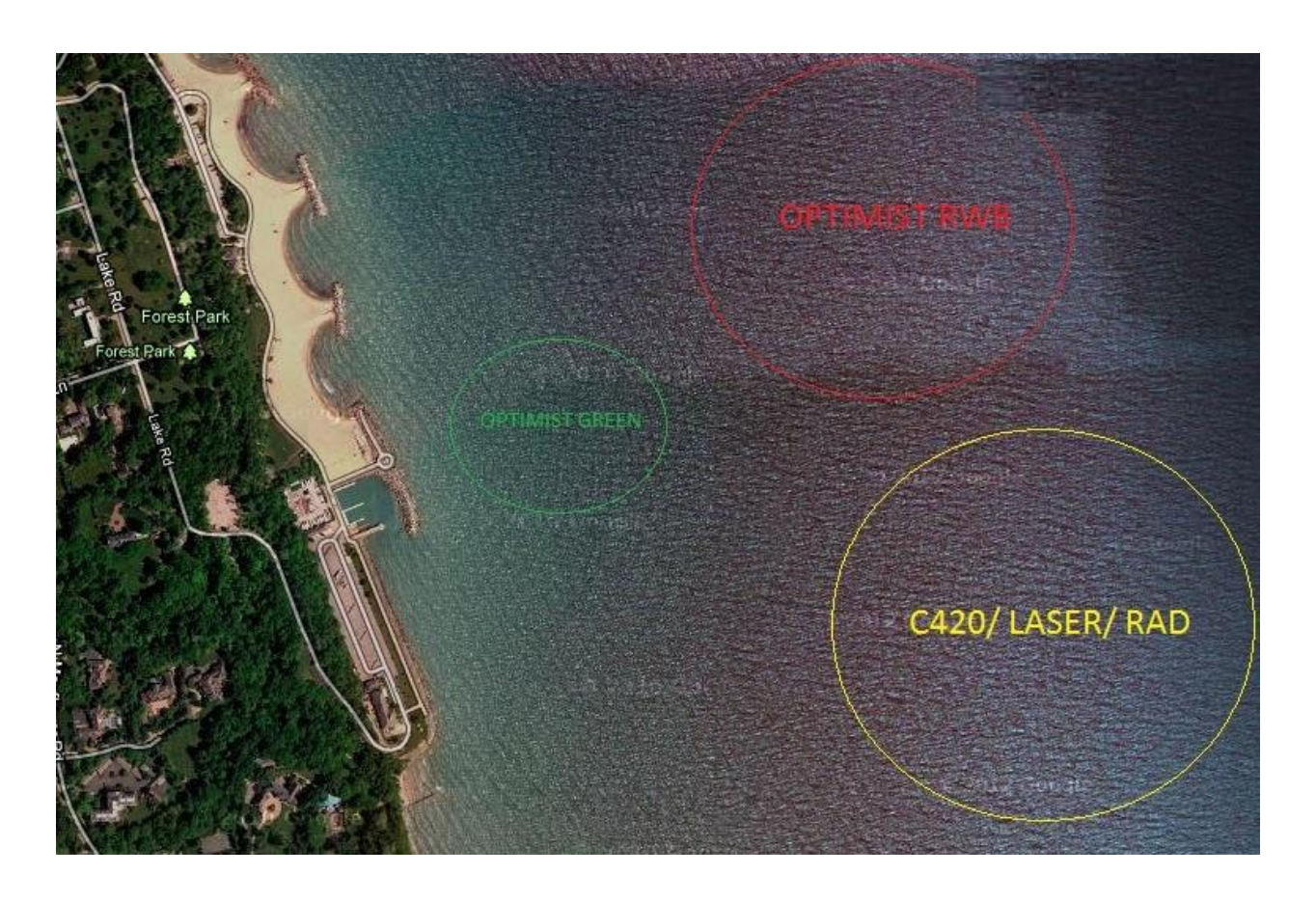
Illustration A - The Racing Area