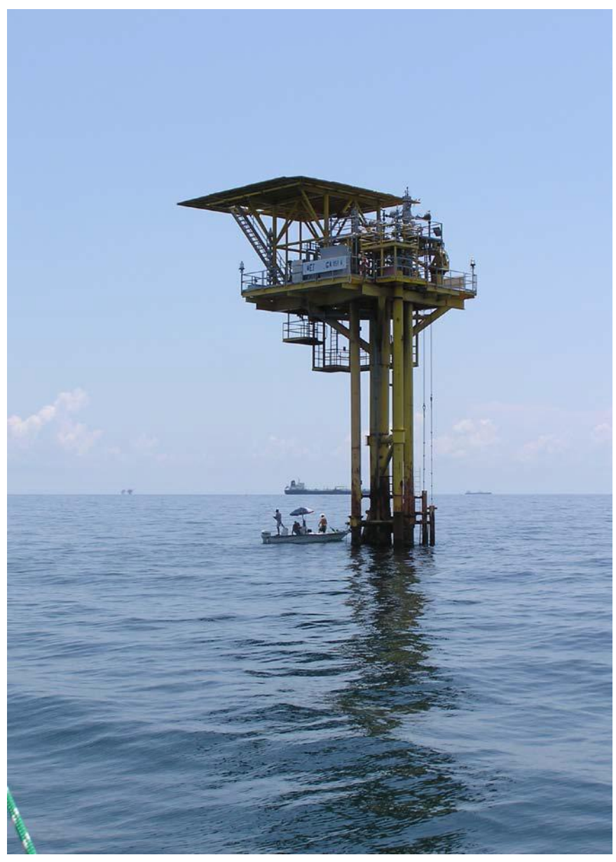
"GA 151 A" Approximate Position: N 29<sup>o</sup> 13.53' W 94<sup>o</sup> 34.69'