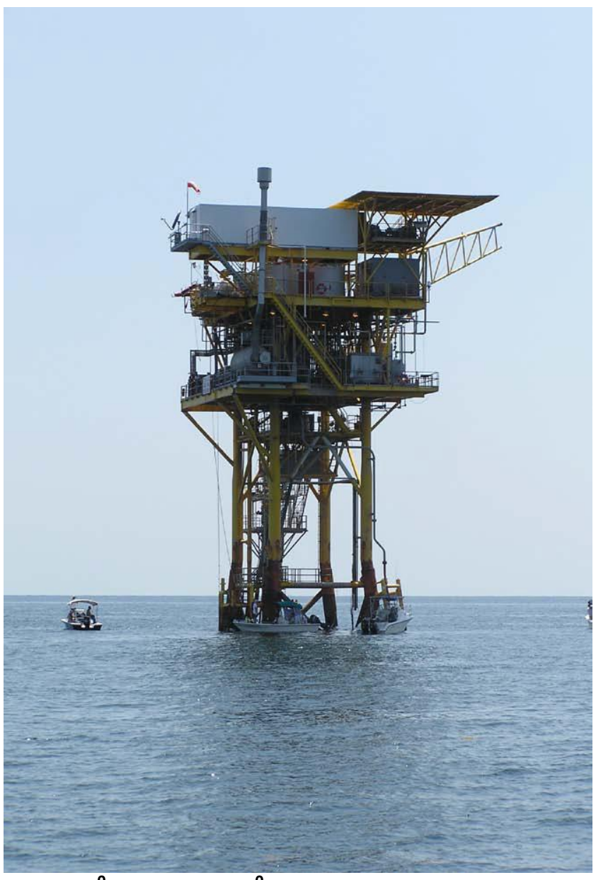
"GA 190" Approximate Position: N 29° 08.50' W 094° 40.18'