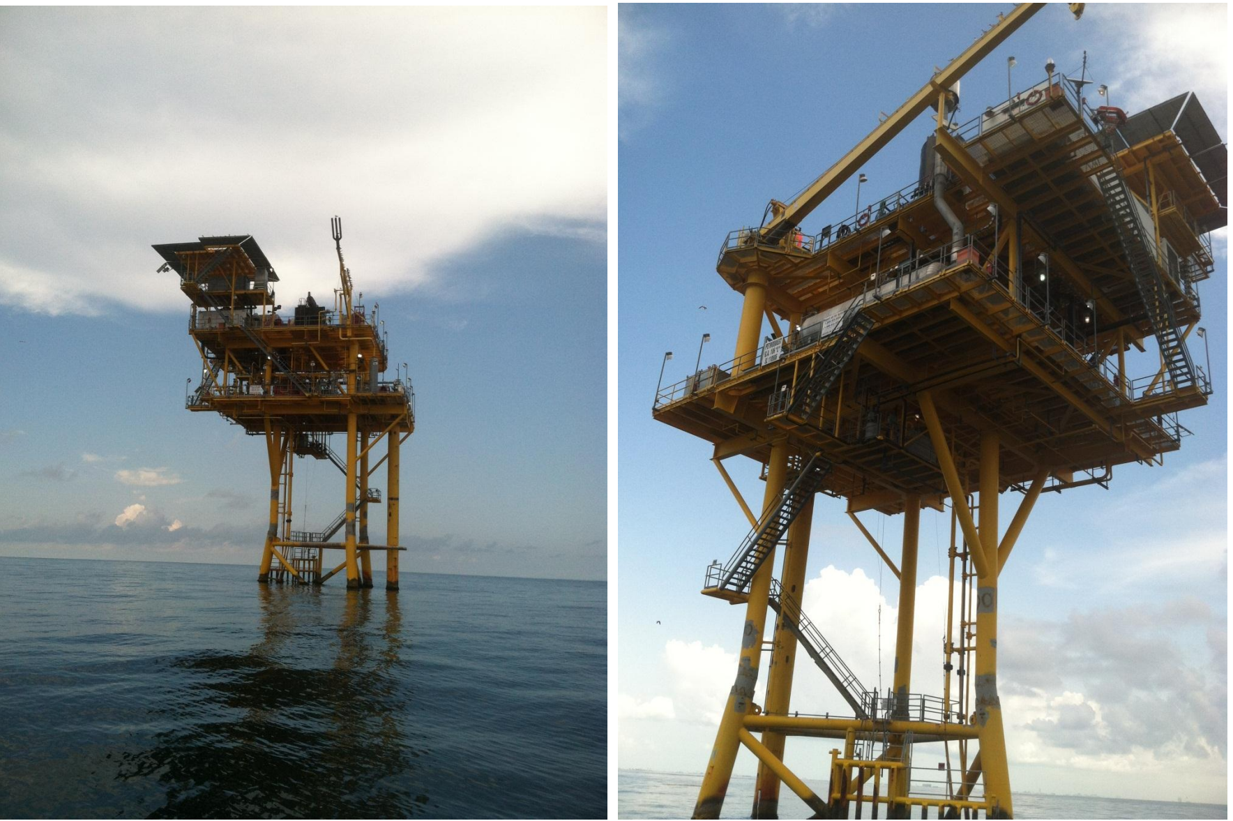
"GA 186 L" Approximate Position: N 29<sup>0</sup> 08.75' W 094<sup>0</sup> 49.84'