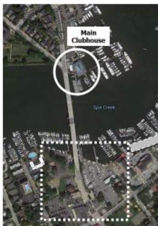
Annapolis Yacht Club - Regatta Venue 38°58'26"N 76°29'07"W