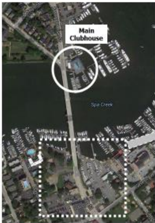
Annapolis Yacht Club - Regatta Venue 38°58'26"N 76°29'07"W