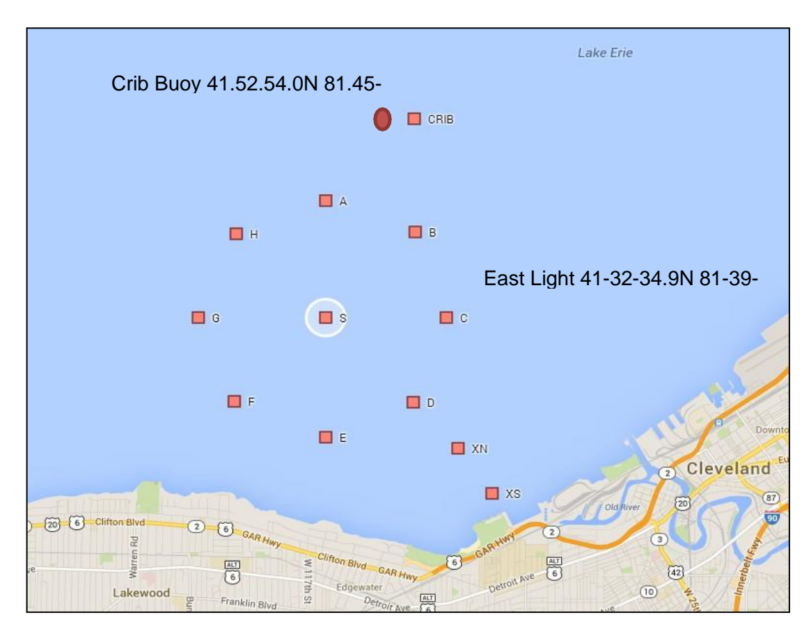
Marks to be passed in the following order:

Edgewater Yacht Club – Cleveland Race Week June 24, 2016