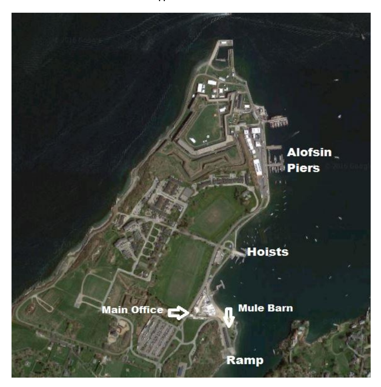
Appendix A – Venue