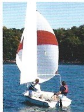
Club 420 age 11-17 (110lbs) double handed boat High School & College Sailing