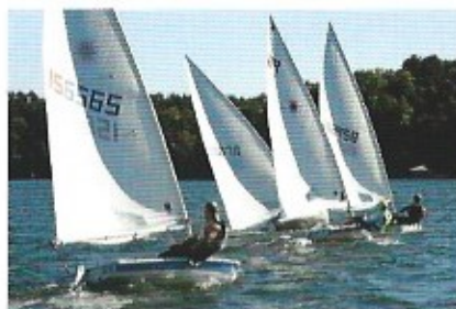
Laser Ages 13+