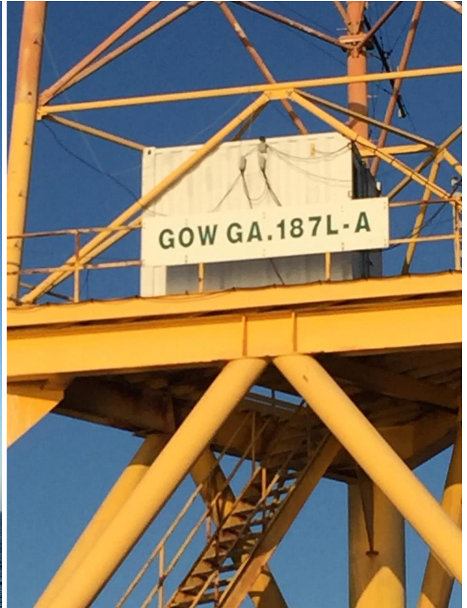
"GA 187L-A" Approximate Position: N 29° 08.52' W 094° 47.83'