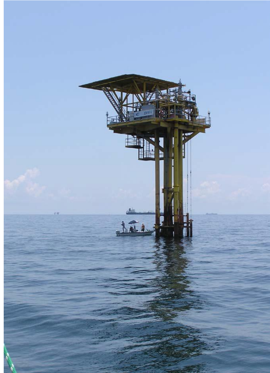
“GA 151 A” Approximate Position: N 29° 13.53’ W 94° 34.69’