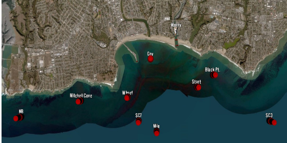
Yellow Start Course Layout