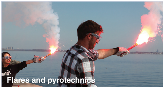
Flares and pyrotechnics

Lakewood Yacht Club and Storm Trysail Club announce their first US Sailing certified Offshore Safety-at-Sea Seminar. The one day seminar on April 14th 2018 is offered with the support of Houston Yacht Club and Galveston Bay Cruising Association and will be hosted by Lakewood Yacht Club.