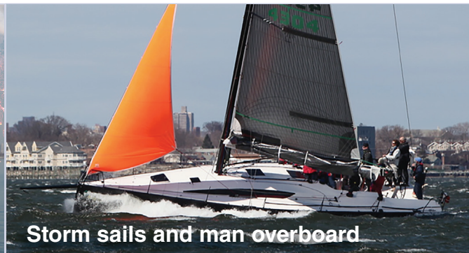
Storm sails and man overboard