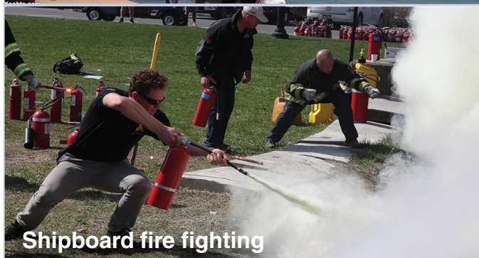
Shipboard fire fighting