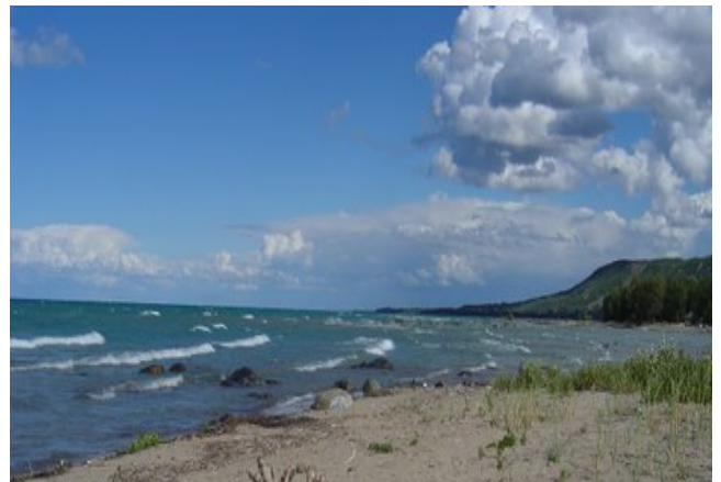
View looking eastward. A typical day 15 knot westerlies - Blue Mountains in background.