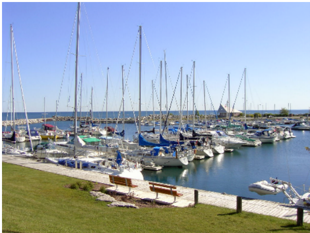
Downtown Thornbury is a few minutes walk. Restaurant/bar, overlooking harbor