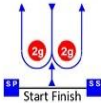
Course: Leeward finish