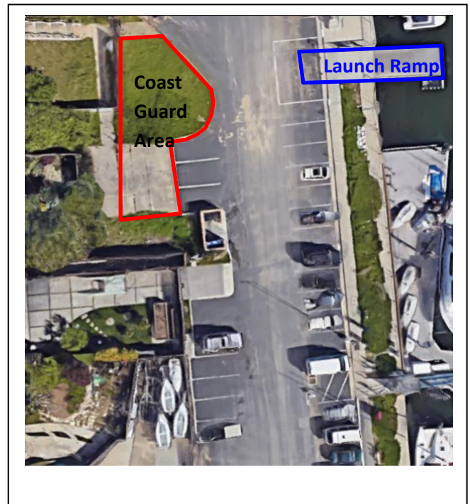
Santa Cruz Small Craft Harbor – MAP 3