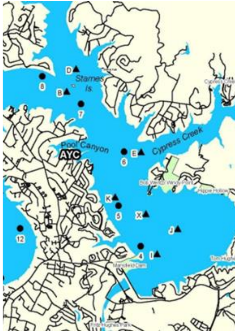
Approximate locations of Numbered Channel Markers.