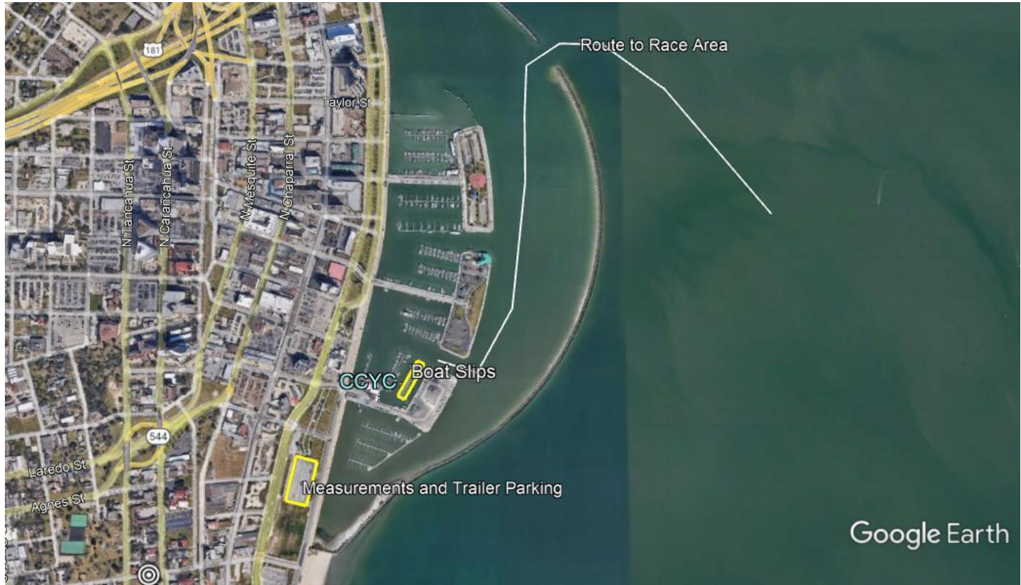
2022 J24 World Championship Rev 3