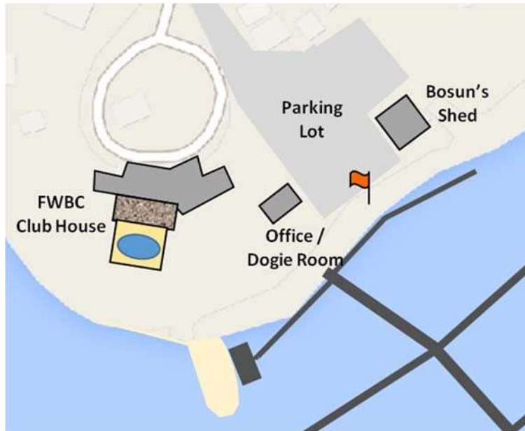
Figure 1 – FWBC Facility Layout