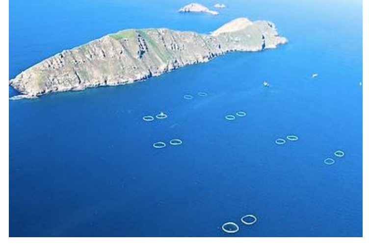
Tuna Pens on east side of South Coronado Island