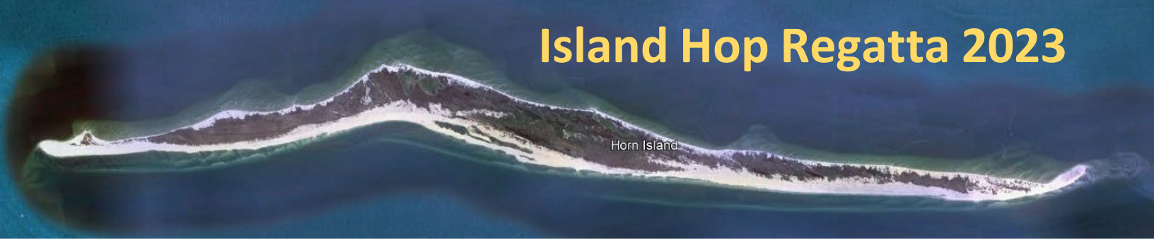
Appendix A: Horn Island Course (Saturday)