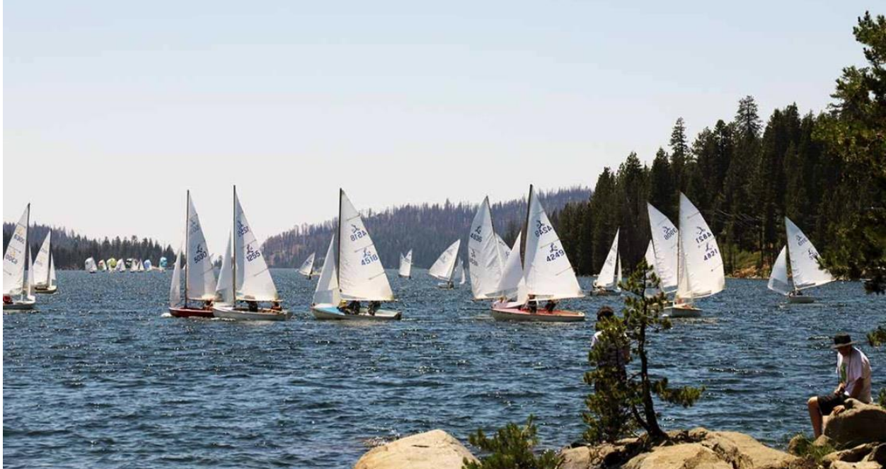
Lido 14s round Mark One with Banshees and San Juan 21s in the distance. Huntington offers suburb spectating for non-sailing family members.