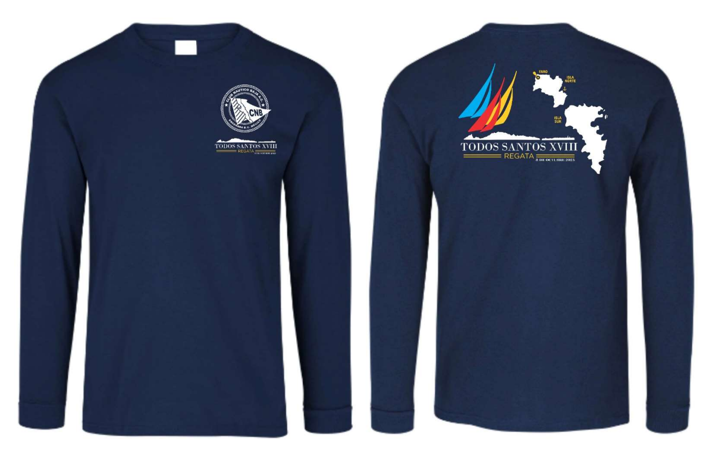
2023 Official Todos Santos T-shirt design. 100% Cotton, S-XXL. Order then for your entire crew, in advance. We do not expect to have extra T shirts during the event, only by pre-order.