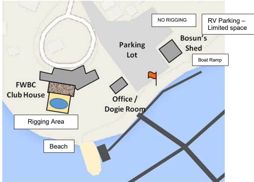
Figure 1 – FWBC Facility Layout