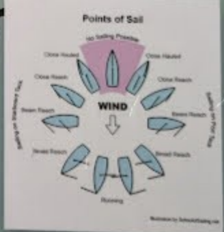
Illustrated by Lyle Doucette