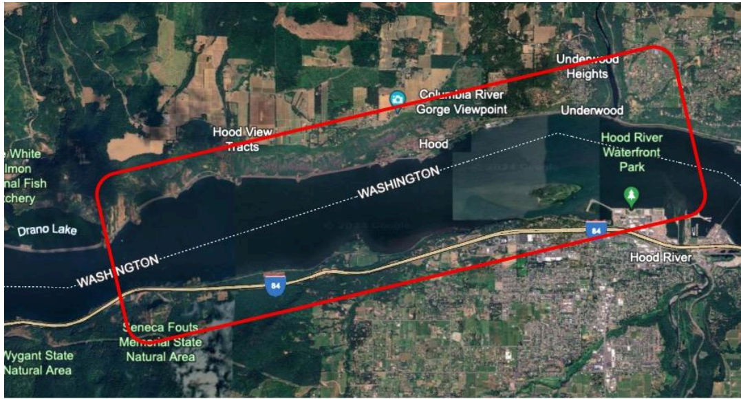
RACING AREA B (Bingen to Chicken Charlie)