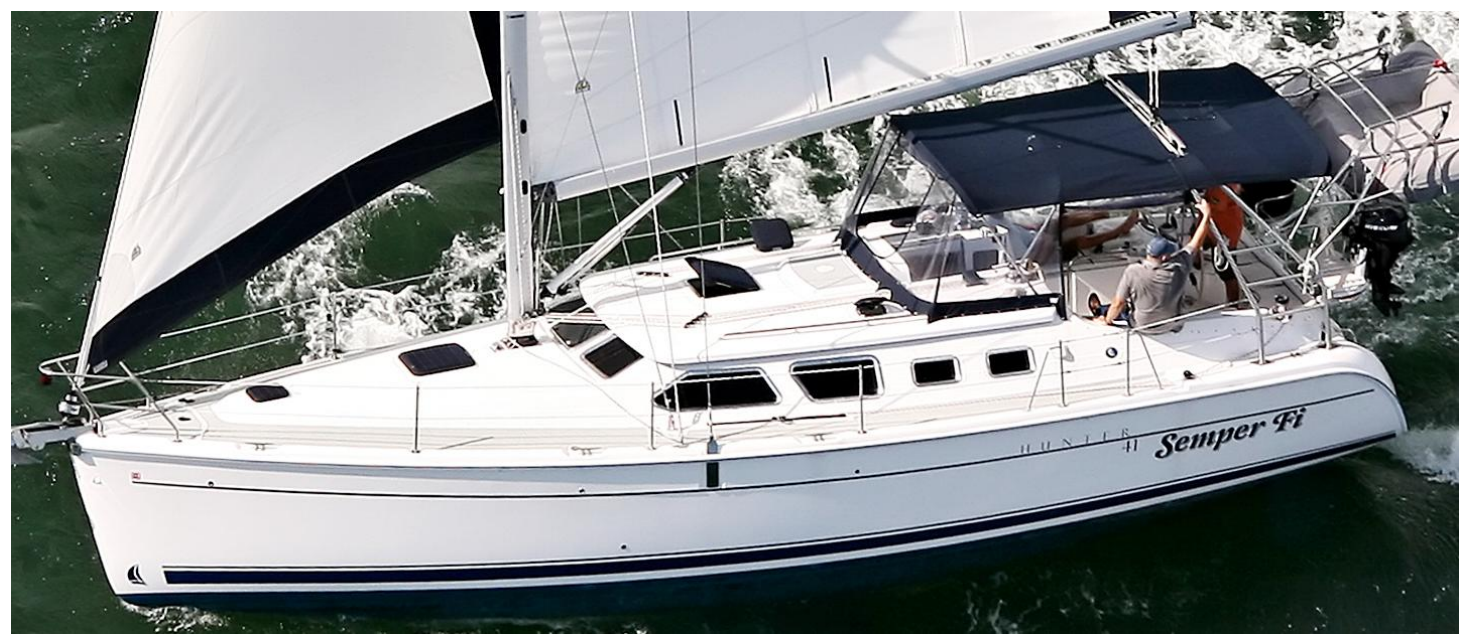
Rotor Envy Helicopter LLC All rights reserved