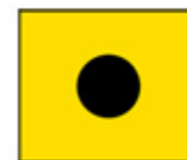
1 Minute rule