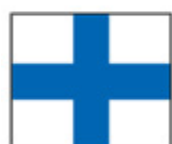
Individual Recall 'X'