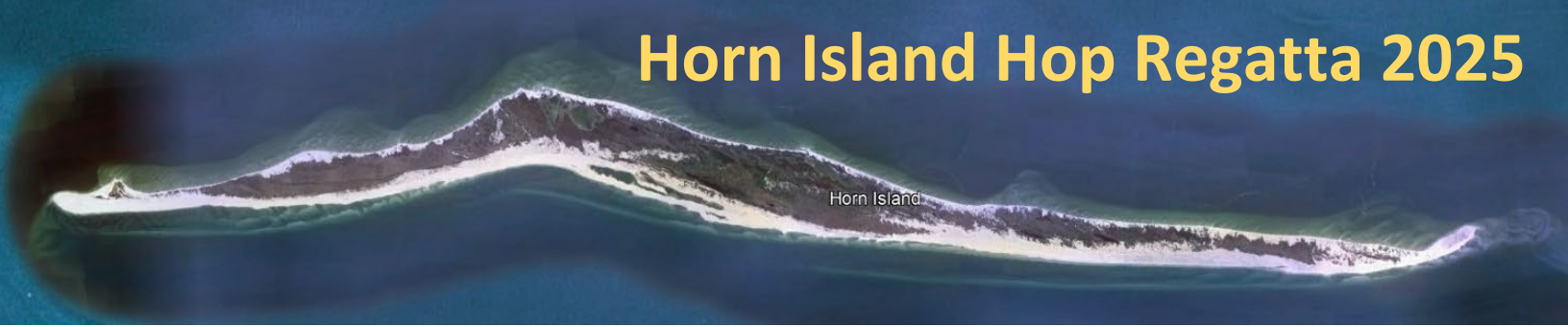
Appendix A: Horn Island Course (Saturday)