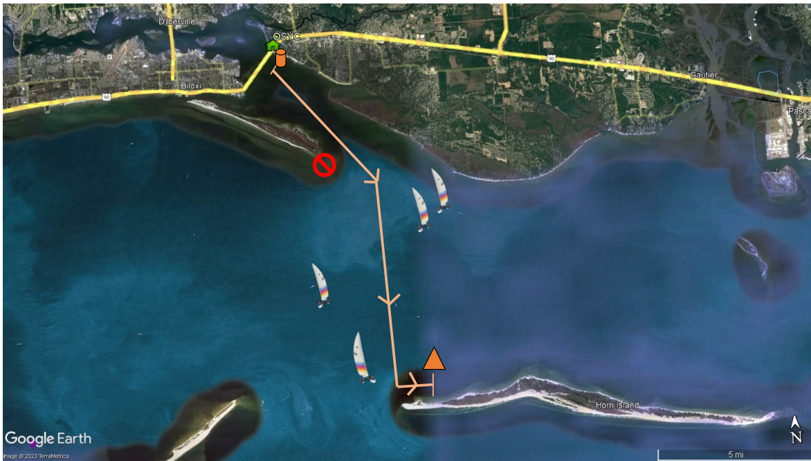
Appendix B: Round Deer Island Course (Sunday)