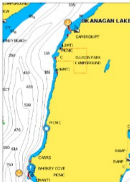
Whiskey Island - Shortened Course Comm Bt)