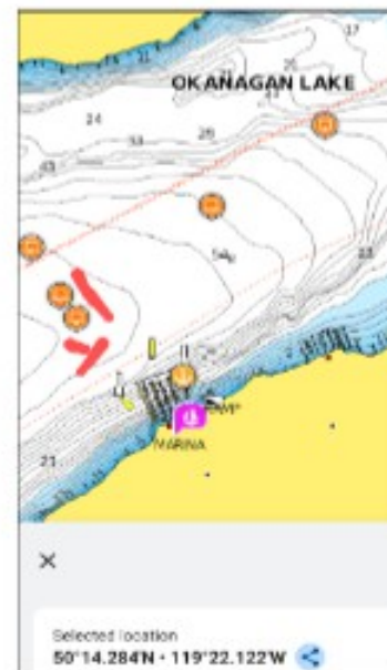
Finish Line VYC (Line between Y and