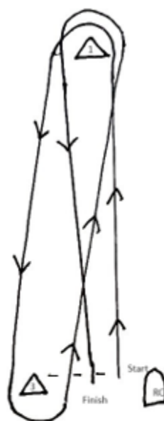
Course 2 - Windward/Leeward - 2 laps