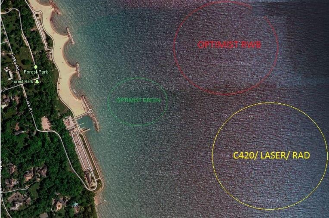
Illustration A - The Racing Area