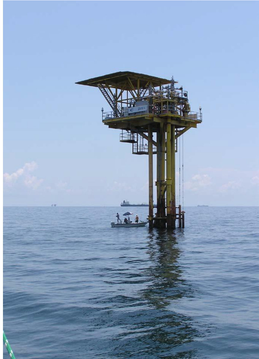
“GA 151 A” Approximate Position: N 29 0 13.53’ W 94 0 34.69’