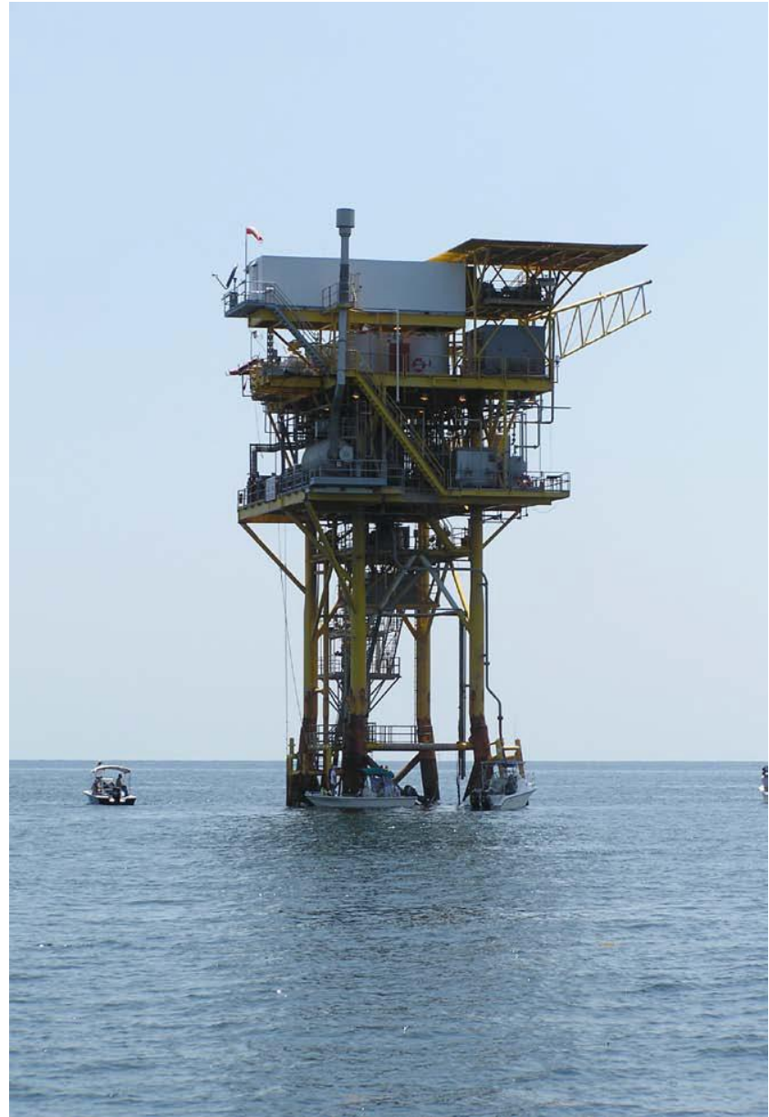
"GA 190" Approximate Position: N 29 0 08.50' W 094 0 40.18'