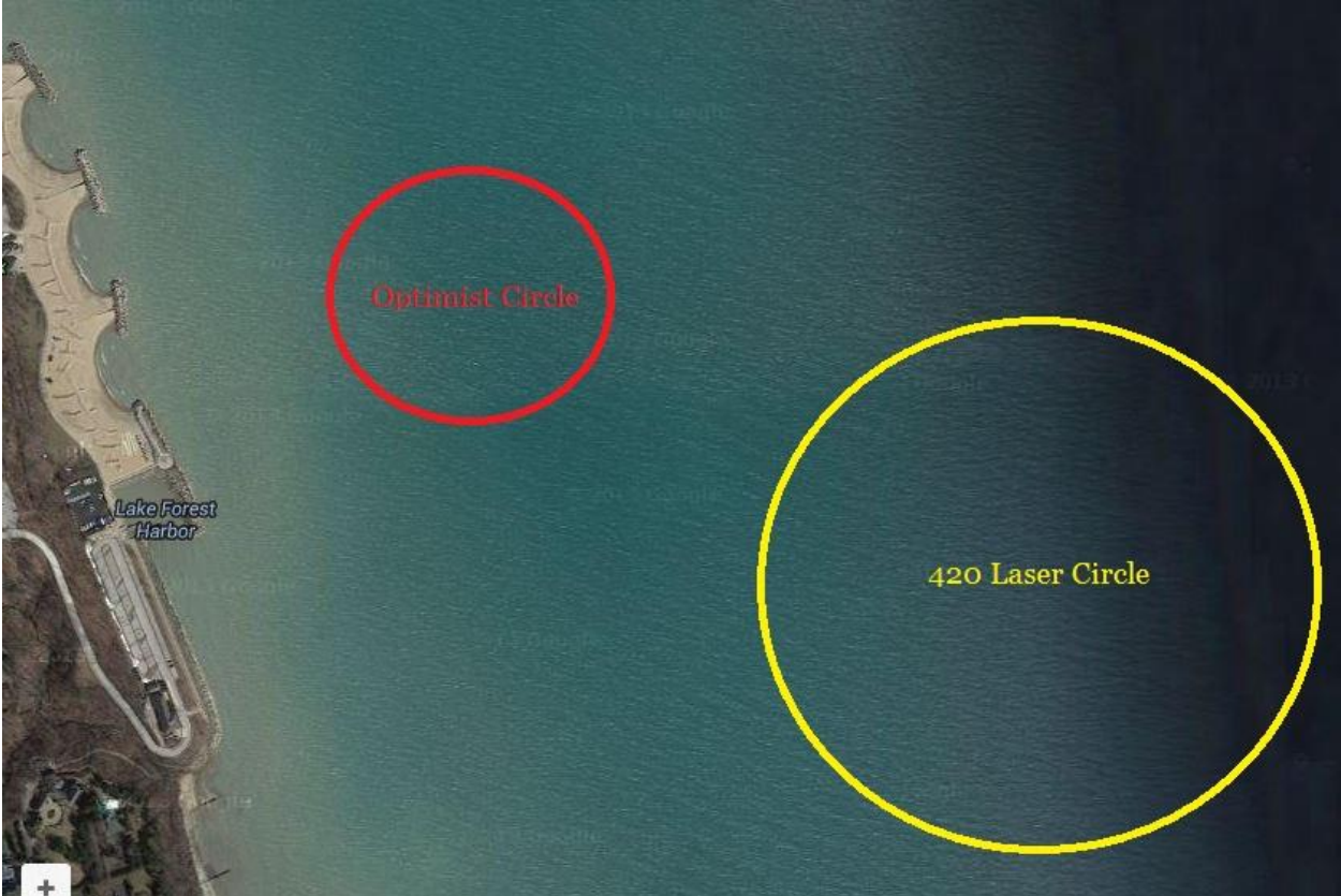
Illustration A - The Racing Area