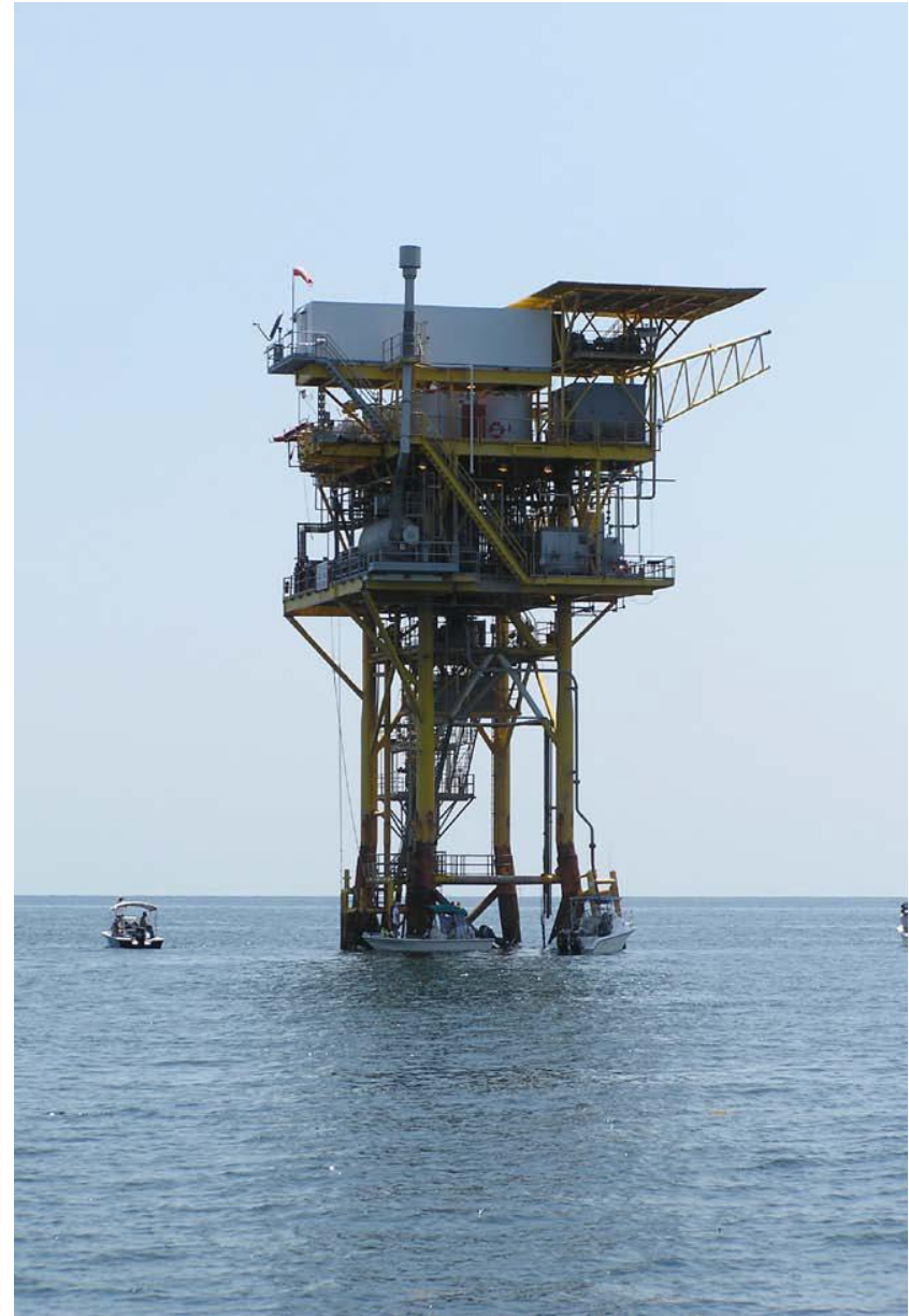
"GA 190" Approximate Position: N 29 0 08.50' W 094 0 40.18'