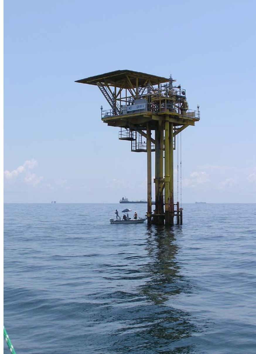
"GA 151 A" Approximate Position: N 29 0 13.53' W 94 0 34.69'