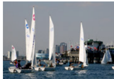
College fleet runs downwind toward the pier

The Hoyas' B boat also led its class with two wins in four races. Coincidentally, the only rival within reach of overtaking them in Sunday's final rounds is last year's runnerup, the U.S. Coast Guard Academy