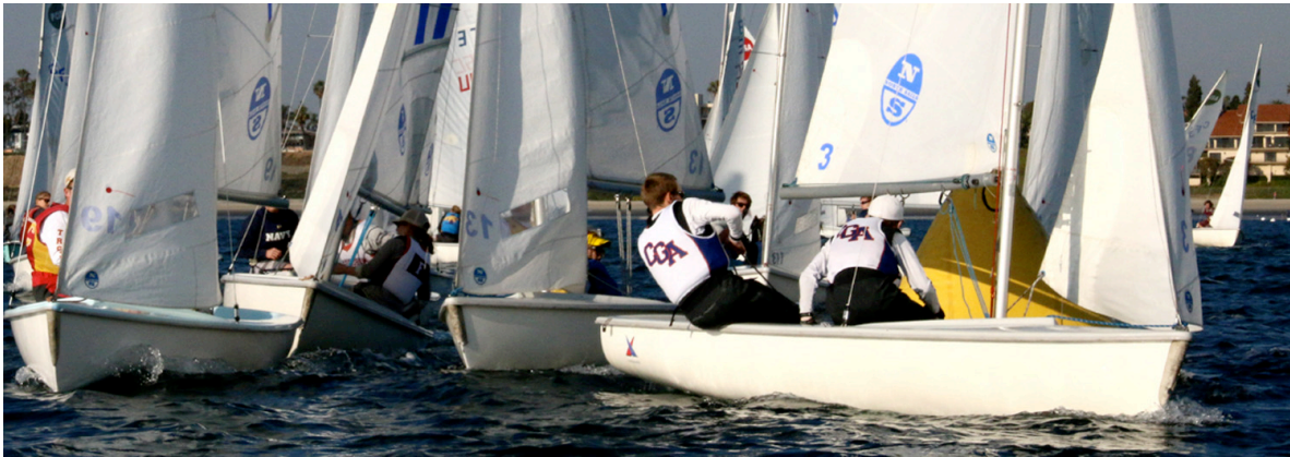
U.S. Coast Guard Academy, currently in second place, leads pack at the windward mark