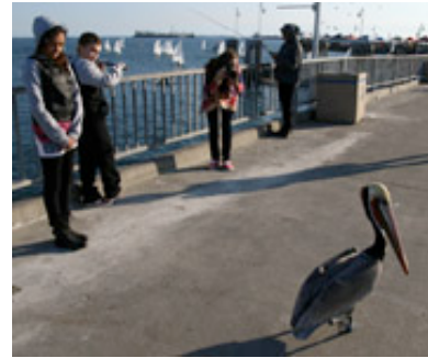
A pelican on the pier steals the show from the sailors

Cathedral Catholic stands third in High School Silver